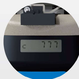
Smart cleave counter