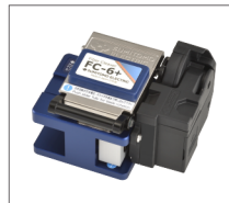
Table-top cleaver FC-6+ series