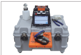
Carrying case with worktable CC-72