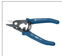
Jacket remover JR-M03