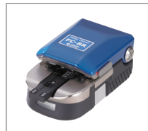
Handy cleaver FC-8R series