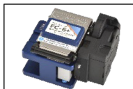
Table-top cleaver FC-6R+