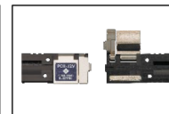
Pitch changing holder PCH-12V