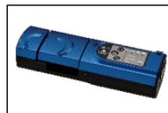
Hot jacket remover JR-7