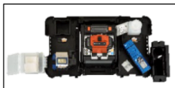
Working tray WT-72