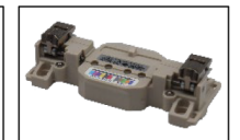
Fibre arrangement tool OFA-02