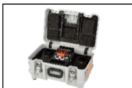
Carrying case CCW-72