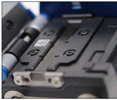
Flat stage for easy cleaning